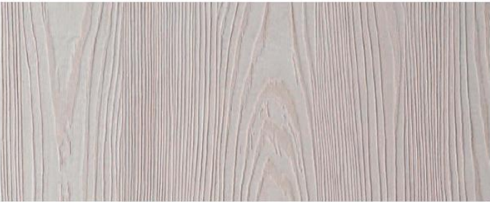
codice: SAHARA - 801/01