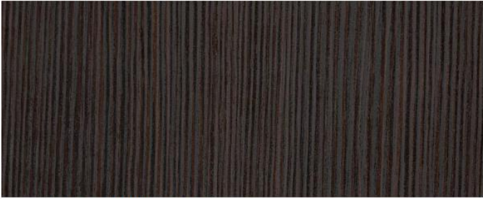
codice: WENGE MELINGA - 43575