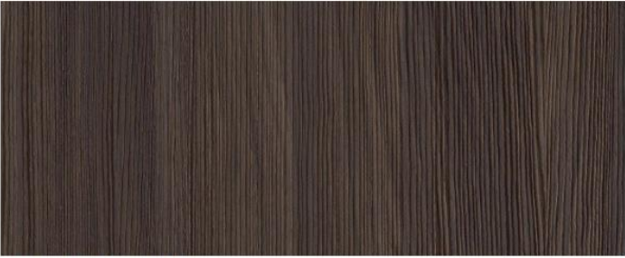
codice: TABACCO OAK