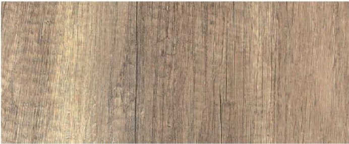
codice: ROVERE CANYON - OAK3